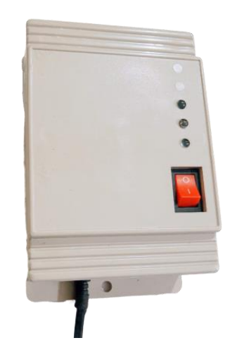
RFID – Show and GO, Ideal for School Attendance