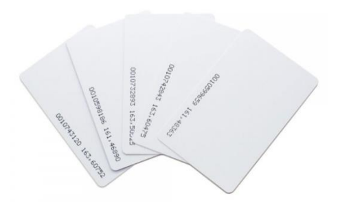
LF - RFID Card with UV Protection